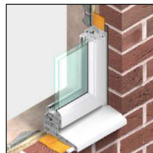
Fig 2: TP610 and FM330 installed